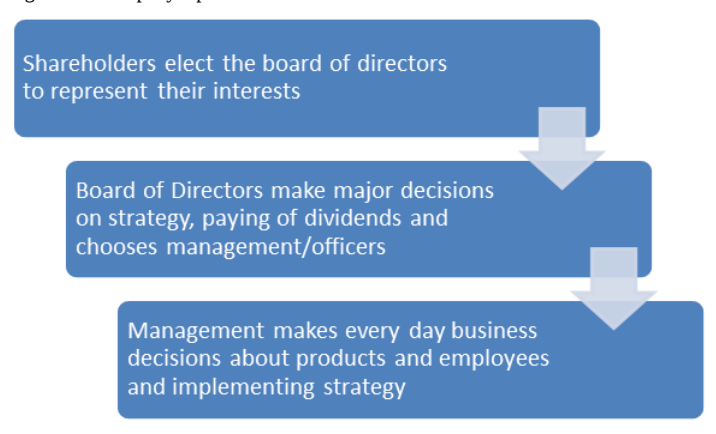
Figure 1.1 Company Operational Structure

Occasionally, the original founders of a business (or their descendants) continue to hold enough shares to influence or actually control its operating and financial decisions. Or wealthy outside investors may acquire enough shares to gain this same level of power. Such owners have genuine authority within the corporation. Because these cases are less common, the specific financial accounting issues involved with this degree of ownership will be deferred until a later accounting class. In most cases, the hierarchy of owners, board of directors, management, and employees remains intact. Thus, stockholders are usually quite removed from the operations of any large corporation.