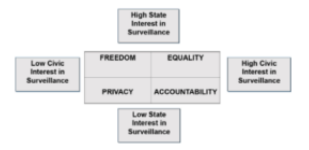
FIGURE 26. Values at stake in surveillance politics.

As these examples illustrate, the situations where activists might campaign for more state surveillance often involve crime rather than national security or data commercialization. In these instances, people look to extend the surveillant power of the state to provide the protection of the law to individuals who are not receiving it. But like the examples of national security and data commercialization, it is assumed that a rule of law exists in society and that authorities have an interest in extending surveillance.g