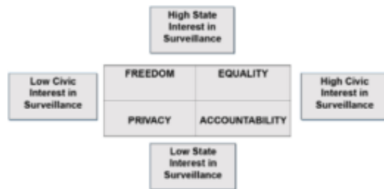
FIGURE 26. Values at stake in surveillance politics.

As these examples illustrate, the situations where activists might campaign for more state surveillance often involve crime rather than national security or data commercialization. In these instances, people look to extend the surveillant power of the state to provide the protection of the law to individuals who are not receiving it. But like the examples of national security and data commercialization, it is assumed that a rule of law exists in society and that authorities have an interest in extending surveillance. 64