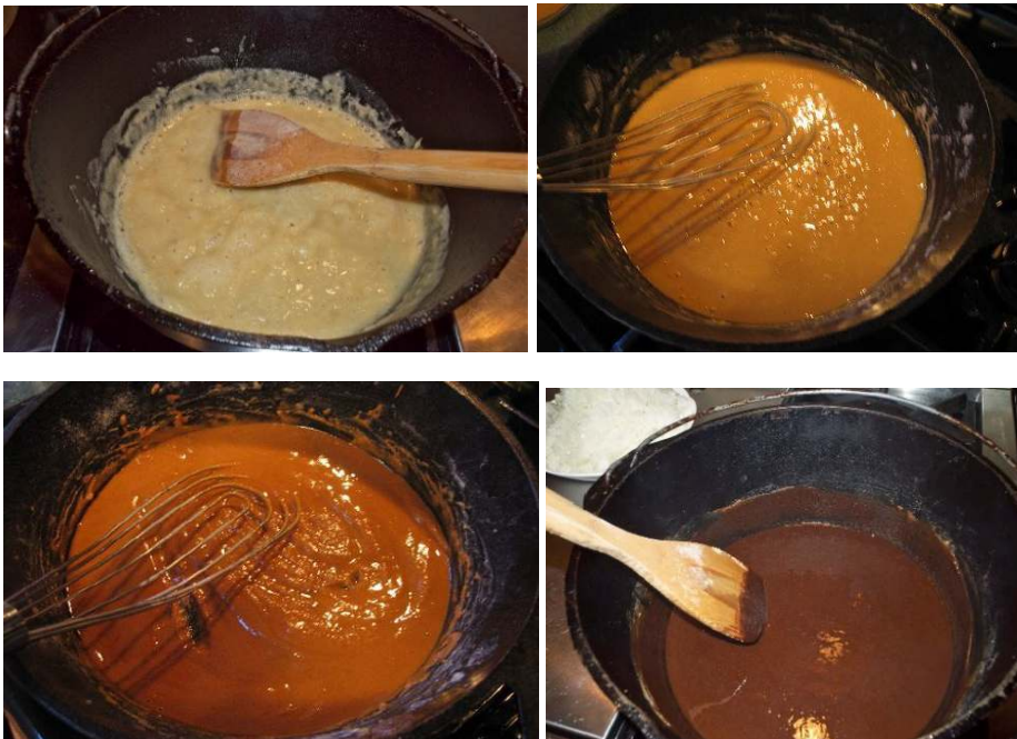
The above pictures are examples of different roux colors.

The most common method for thickening liquids with flour is to prepare a roux; by cooking the flour with an equal weight of butter. This attenuates the flavor of the flour and eliminates lumps. Then, hot liquids are added to the cooked roux, and the mixture is brought to a simmer until it thickens. Because flour contains proteins and other compounds that impart flavor, sauces thickened with roux are usually skimmed for at least 30 minutes once they have been brought to a simmer to eliminate impurities.