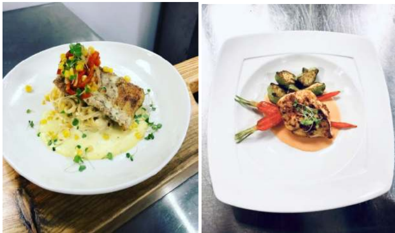
Béchamel sauce plate up examples.

This page titled 1.5: Béchamel Based Sauces is shared under a CC BY-NC-SA 4.0 license and was authored, remixed, and/or curated by Amelie Zeringue and William R. Thibodeaux .