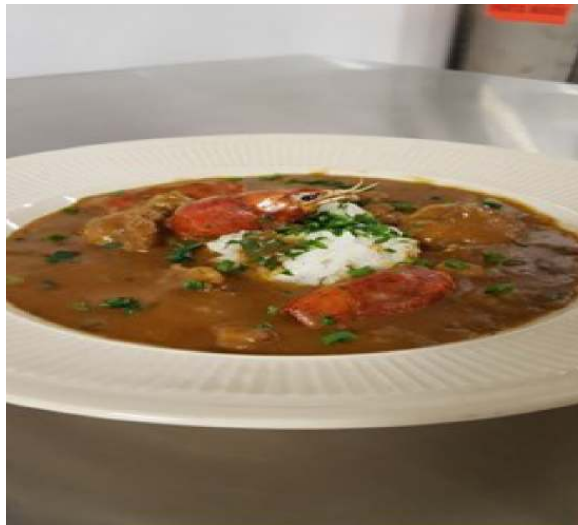
Crawfish Bisque plate up example.