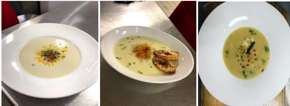
Soup plate up examples.

This page titled 1.12: Pureed, Thick Soups is shared under a CC BY-NC-SA 4.0 license and was authored, remixed, and/or curated by Amelie Zeringue and William R. Thibodeaux .