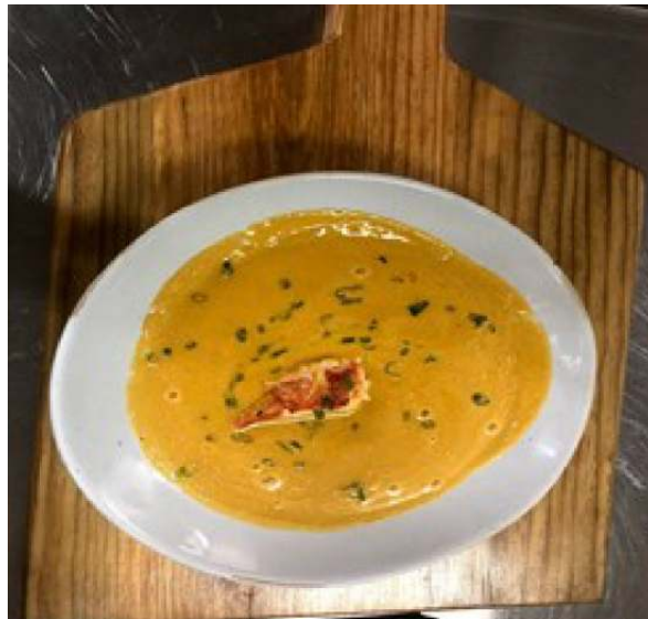
Lobster bisque plate up example.

This page titled 1.13: Bisques and Cream Soups is shared under a CC BY-NC-SA 4.0 license and was authored, remixed, and/or curated by Amelie Zeringue and William R. Thibodeaux .