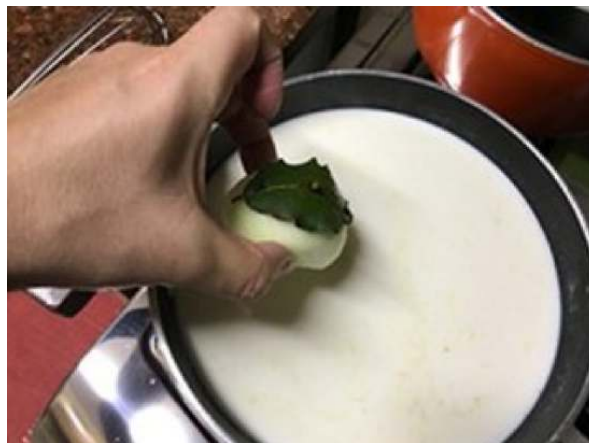
Example of an onion piquet.

Onion Piquet - attach a bay leaf to a piece of onion by pushing whole cloves (like a toothpick) through the bay leaf into the onion. This is the classic seasoning for béchamel sauce. Clove is a spice that are flower buds from a tree. Very aromatic (May be considered as a Christmas Spice).