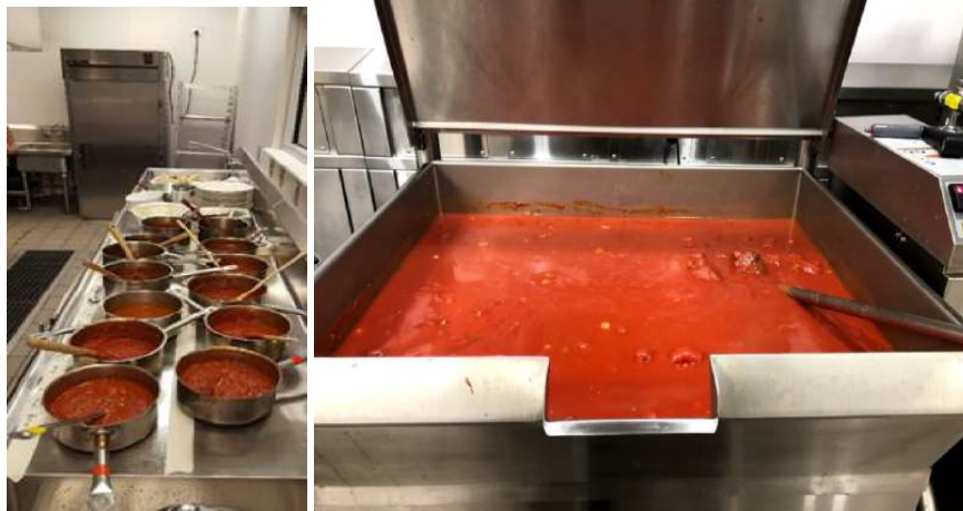
Tomato sauce production.

Sauté 5 ounces (140 grams) sliced mushrooms in 1/2 ounce (14 grams) whole butter. Incorporate the tomato sauce and then stir in 5-ounces (140 grams) cooked ham (julienne) and 5 ounces (140 grams) cooked tongue (julienne). Bring to a simmer.