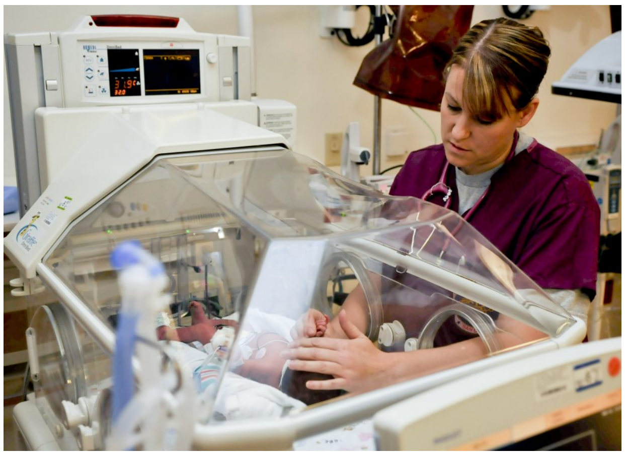
Figure 2.7 Using Touch as Therapeutic Communication

Touch is a powerful way to professionally communicate caring and empathy if done respectfully while being aware of the patient's cultural beliefs. Nurses commonly use professional touch when assessing, expressing concern, or comforting patients. For example, simply holding a patient's hand during a painful procedure can be very effective in providing comfort. See Figure 2.7<sup>[6]</sup> for an image of a nurse using touch as a therapeutic technique when caring for a patient.