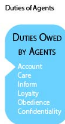
Figure 15.2 Duties of Agents

Agents are fiduciaries of principals and so they are required to act with the highest duty of care. In particular, agents owe principals the following duties: